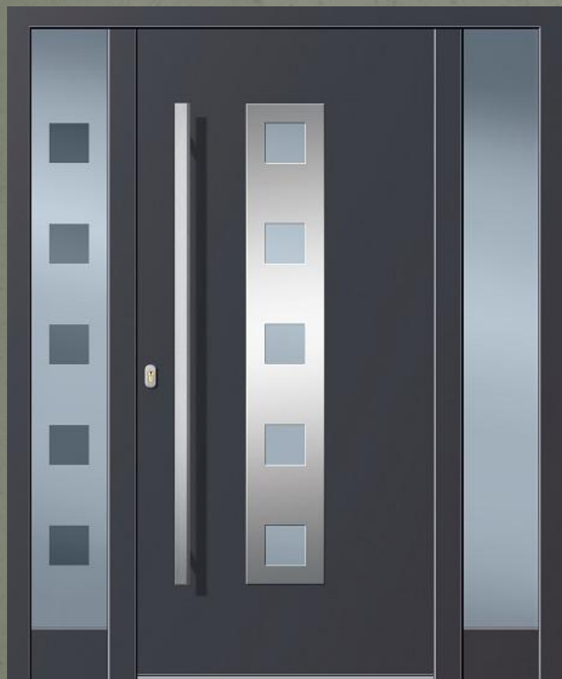
ELEKTRAT 3 + 2N