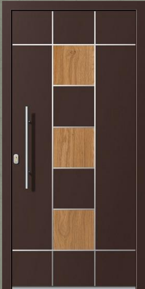
BALANCE - H