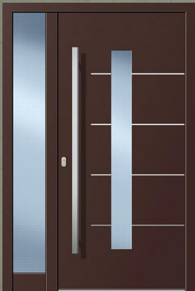
GRYF - C 2 + 1N