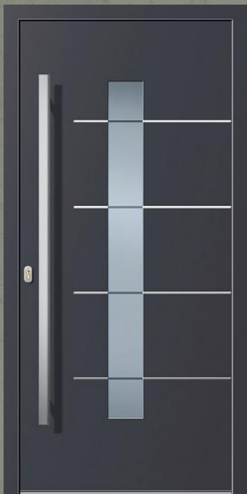
GRYF – C 1