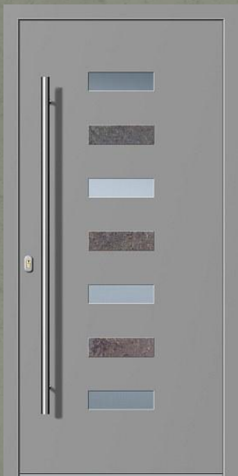
DOREMI - S /2