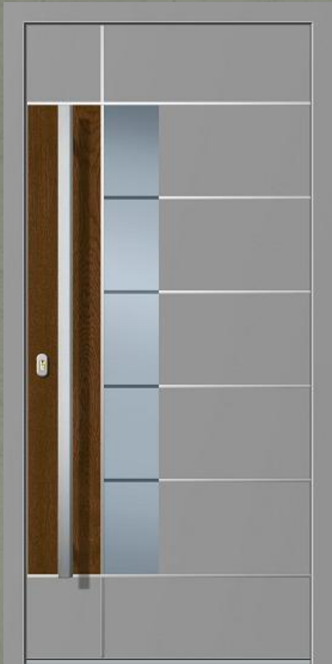
DANDY – H /1