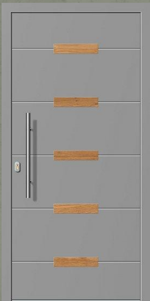
WERST – H/1