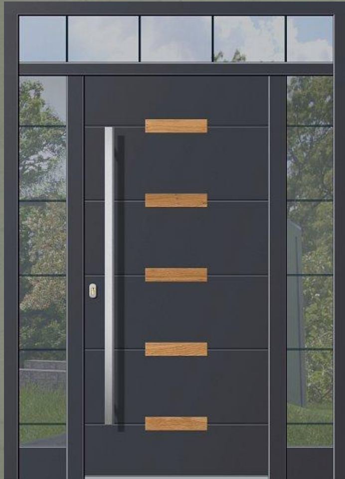
WERST - H 3 +3N