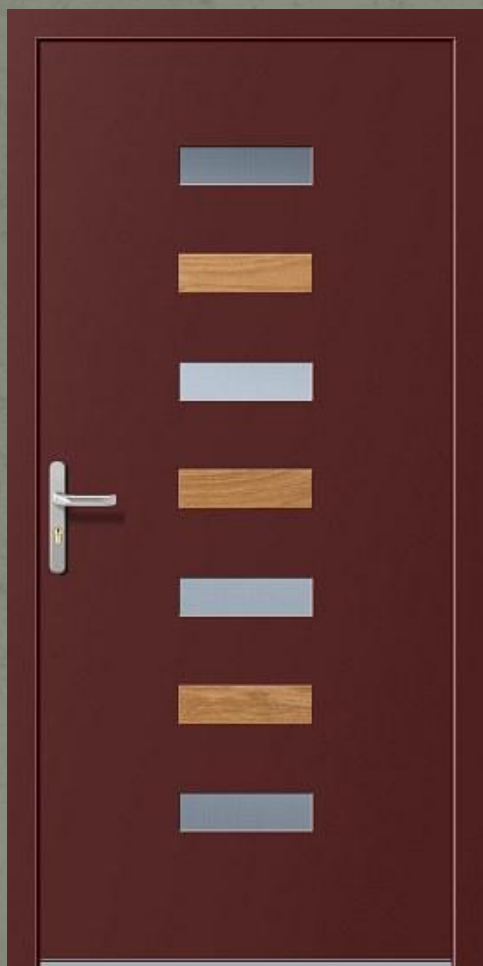
DOREMI – H/1