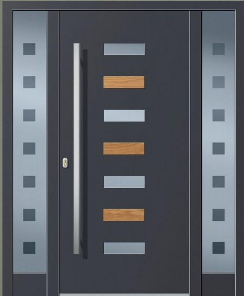
DOREMI – H +2N